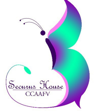
Clayton County Association Against Family Violence, Inc.

Items for infants & children include: diapers (all sizes, but esp. large & x-large) baby oil, baby wipes & Vaseline bottles with nipples, socks, underwear & undershirts (all sizes) crayons, coloring books, markers Items for the women include: new underwear (all sizes), pajamas, gowns & slippers (all sizes) personal hygiene products, hair blow dryers, hair care products for women of all color Items for the shelter include: toiletries (deodorant, shampoo, bar soap), paper towels, toilet tissue & facial tissues tooth brushes, toothpaste & mouthwash, first aid products; cough drops; lip balm Infant & Children's Tylenol (non-generic)